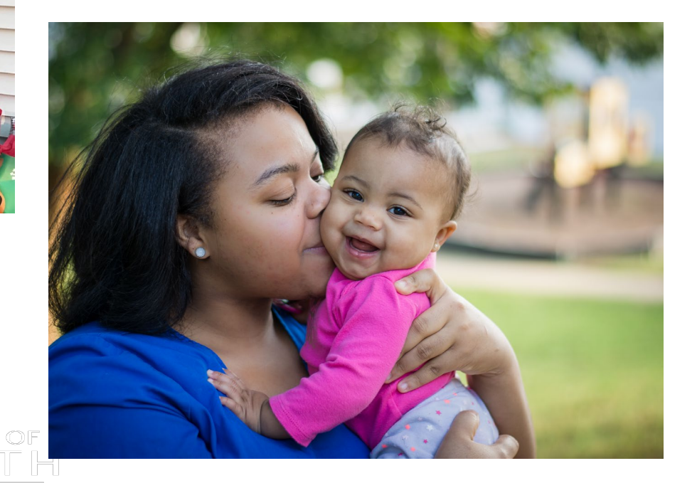
Investment, Opportunity, Health.