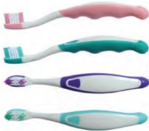
Child toothbrushes (up to age 3)