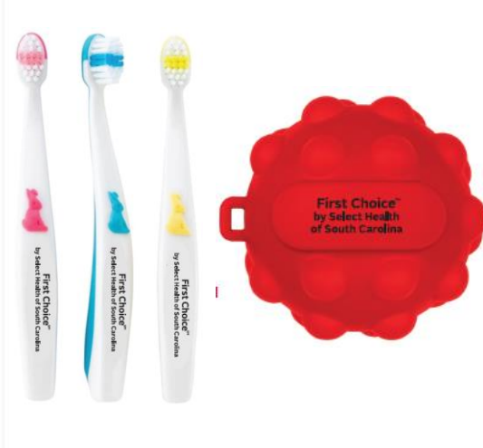
Toothbrush + Popper Ball