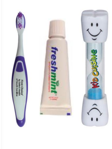
Toothbrush + Toothpaste + Timer