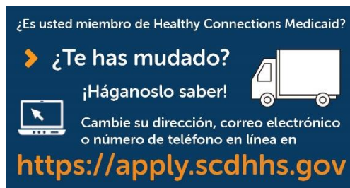
Recursos en Espanol