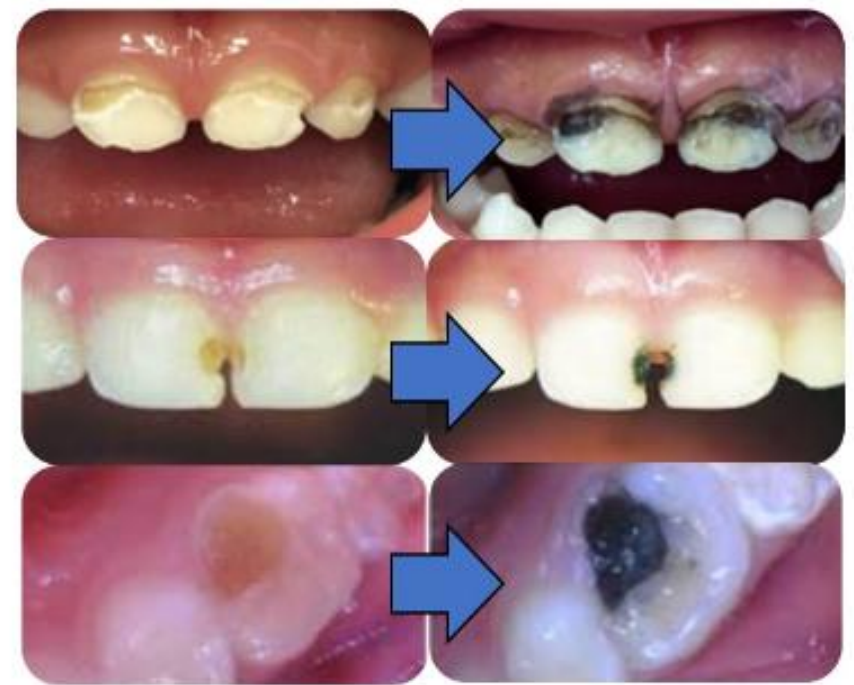
Before and After SDF Application